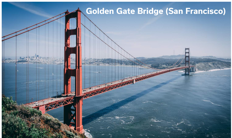
Golden Gate Bridge (San Francisco)