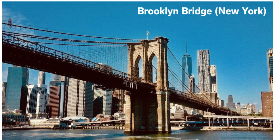
Brooklyn Bridge (New York)